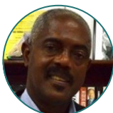
President of the Senate HON. CHESTER HUMPHREY (Grenada)

“Participating in these instances allows us to present the ways in which parliaments can play a role to support the resolution of difficulties between and within States.”