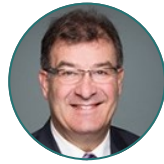
Member of Parliament HON. ROBERT NAULT (Canada), Vice-President of ParlAmericas

“At this OAS General Assembly ParlAmericas reaffirms its commitment to contribute to the achievement of the agreements and actions taken, and to support, from the legislative branch, the attainment of well-being for all in the Americas and in the Caribbean.”