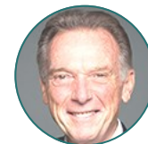
Member of Parliament HON. PETER KENT (Canada)

“As a former Minister of State responsible for the Americas, participating as a part of this delegation was a terrific wakeup realization for me regarding the potential of ParlAmericas. I believe that ParlAmericas provides a platform for parliamentarians of all stripes to engage in diplomacy in the Inter-American system and complement the work of the OAS. For future General Assemblies, I would encourage a more formal interaction with OAS delegations be explored along the lines of the official dialogue held with civil society.”