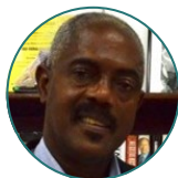
President of the Senate HON. CHESTER HUMPHREY (Grenada)

“Participating in these instances allows us to present the ways in which parliaments can play a role to support the resolution of difficulties between and within States.”