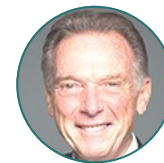
Member of Parliament HON. PETER KENT (Canada)

“As a former Minister of State responsible for the Americas, participating as a part of this delegation was a terrific wakeup realization for me regarding the potential of ParlAmericas. I believe that ParlAmericas provides a platform for parliamentarians of all stripes to engage in diplomacy in the Inter-American system and complement the work of the OAS. For future General Assemblies, I would encourage a more formal interaction with OAS delegations be explored along the lines of the official dialogue held with civil society.”