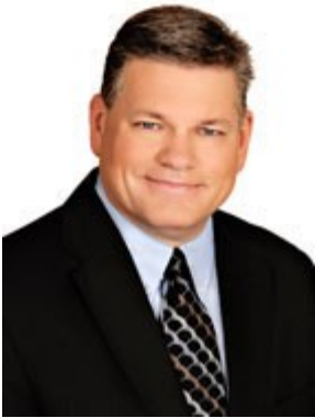
Randy Hoback President Member of Parliament Canada