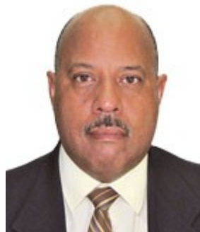
Armando Torres Aguirre Member of the National Assembly Cuba