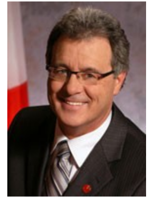
Michael L. MacDonald Senator Canada