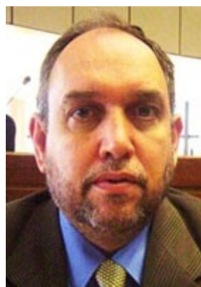
Alberto Grillón Conigliaro Senator Paraguay