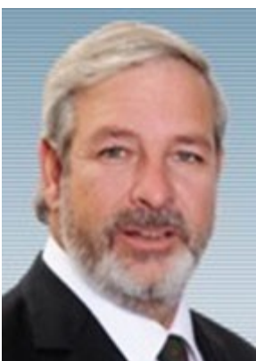
Ignacio Urrutia Bonilla Member of the Chamber of Deputies Chile