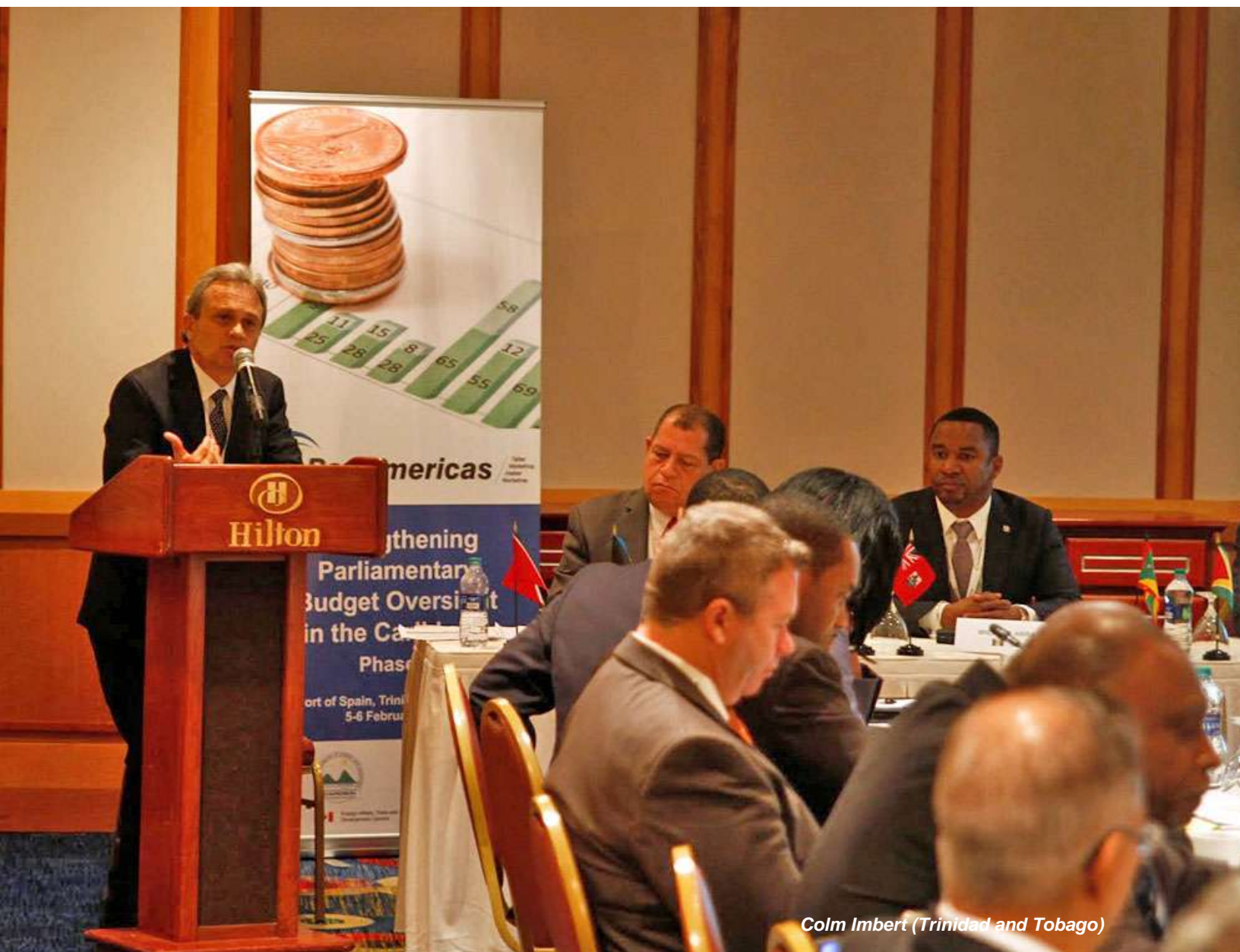
Colm Imbert (Trinidad and Tobago)

Mr. Imbert said that in his case, he has not experienced much partisanship from the ministers on his committee.