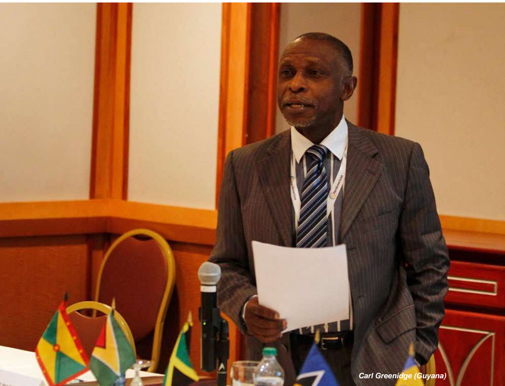
Carl Greenidge (Guyana)

Mr. Greenidge opened his remarks by outlining three key roles of parliament: to pass legislation, to scrutinize the budget prior to its adoption, and to oversee budgetary spending. Budget approval involves review of budgetary estimates. Noting that the structure of most parliaments in the Caribbean is derived from the British parliamentary system, he explained that legislatures in parliamentary systems tend to play a less significant role in scrutinizing the budget prior to its adoption (i.e., ex-ante ) than