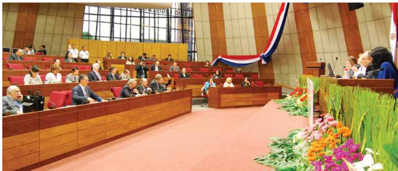
First Session of the Plenary Assembly