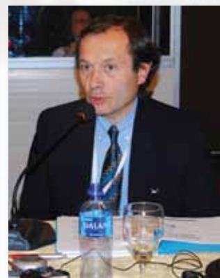
Expert Gustavo Béliz (IDB)