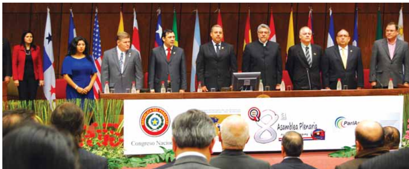
Inaugural Session of the Plenary Assembly with His Excellency the President of Paraguay, Fernando Lugo