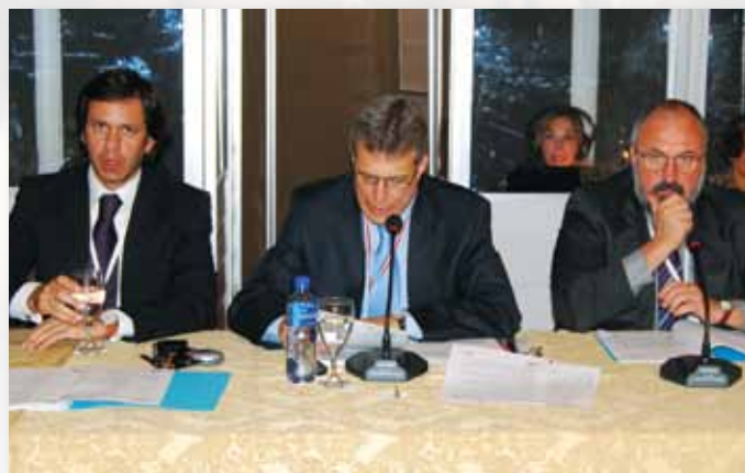
Francisco Peralta, Senate of Paraguay

The Plenary Assembly passed a resolution to open the position of member of the Executive Committee representing the Central American sub-region for the remaining year of a two-year term, to expire at the Ninth Plenary Assembly of FIPA-ParlAmericas.