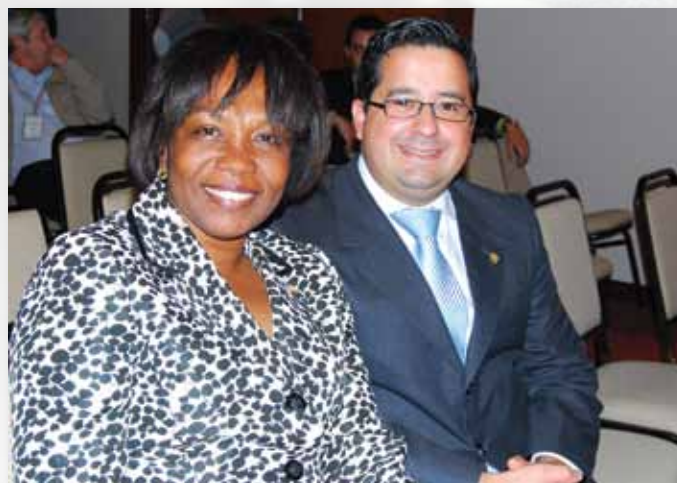
Francisco Peralta, Senate of Paraguay

The recommendations called for integration of public policy on population safety and security, disaster risk management and climate change; strengthening of cooperation between countries; establishment or strengthening of the institutional framework for managing risks and disasters; promotion of citizen participation; and strengthening of social capital in disaster recovery. As well, they proposed the promotion of statistical systems and comparative indicators on crime and violence, reinforcement of special parliamentary committees and encouragement of working relationships with universities and interdisciplinary specialists, analysis of public budgets