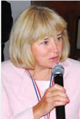
Céline Hervieux-Payette (Canada)

enough to be implemented immediately. These focused primarily on the proposed governance system of the organization, including redesigning the Executive Committee into a larger Board of Directors. Members of the Strategic Plan Steering Committee then spoke to various elements of the resolution.